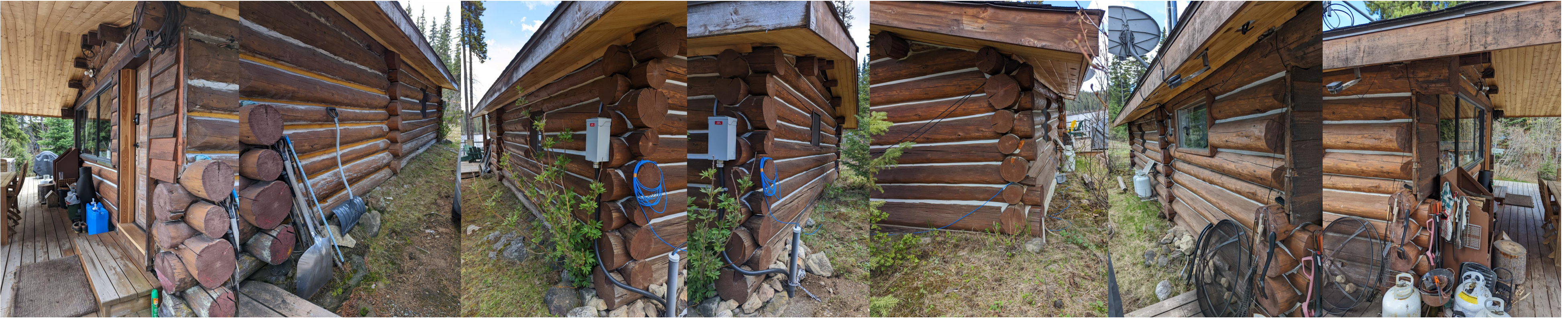
Site Photos 2022 05 30