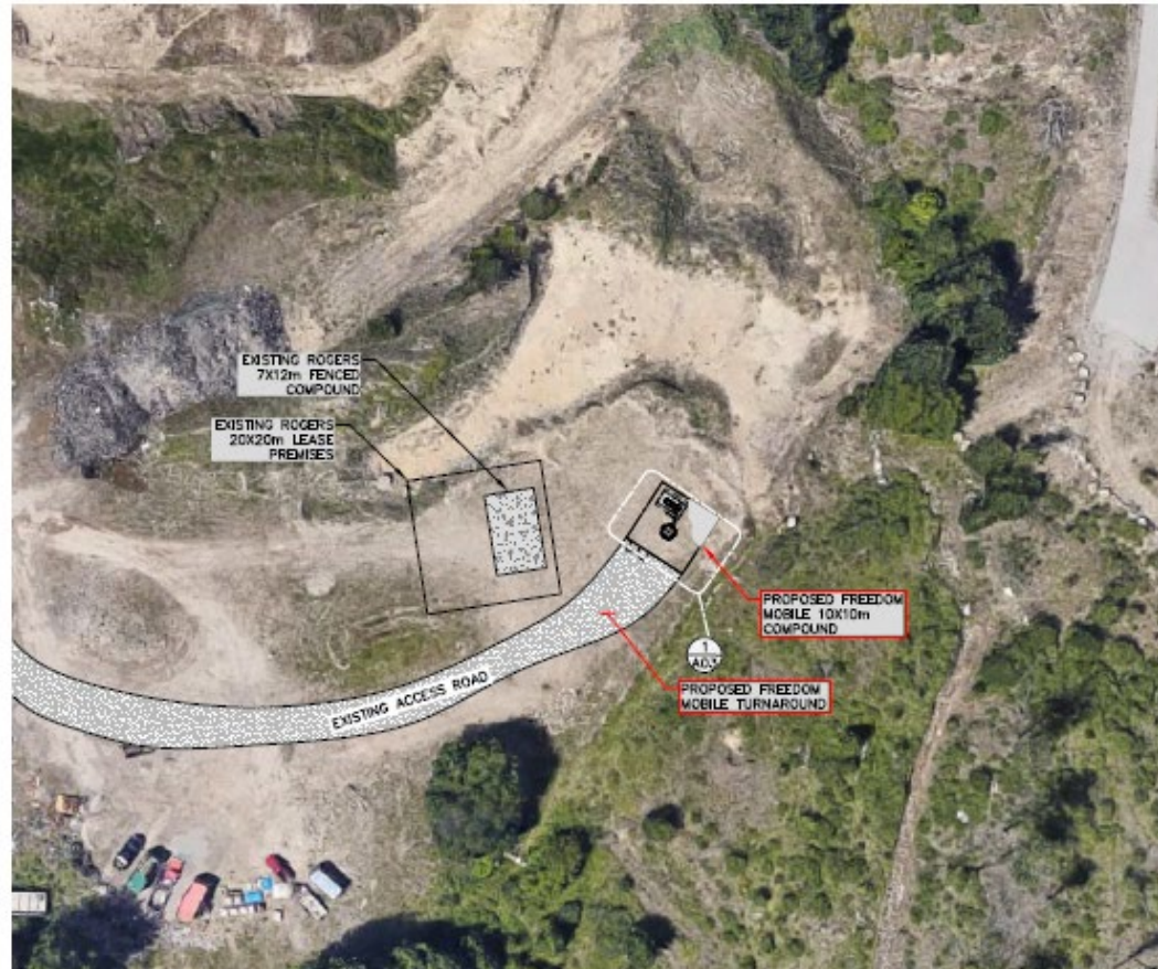
1 SITE LAYOUT