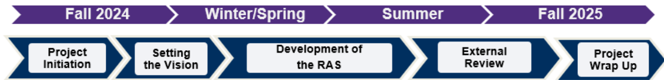
Figure 1: RAS Phase 2 Project Timeline

A consulting contract to lead the project was awarded to Upland Agricultural Consulting. This phase of project has recently commenced and is currently in phase 1 (see Figure 1 below). A collaborative process will be utilized to inform the project involving RDCO staff and a working group comprised of staff from partnering communities, subject matter experts, and key industry leaders.