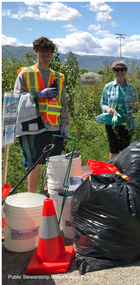
Public Stewardship Weed Pulling Event