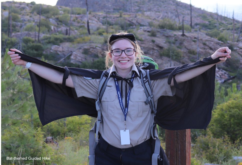
Bat-themed Guided Hike.