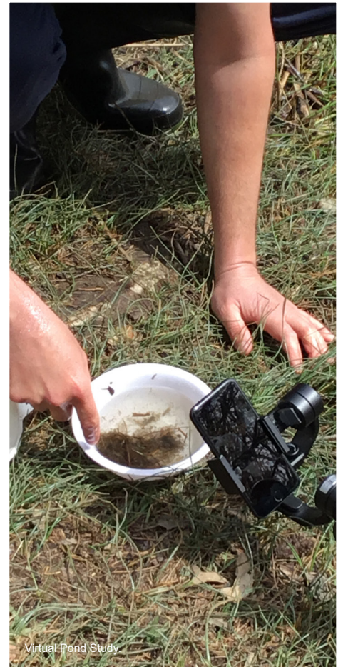
Virtual Pond Study