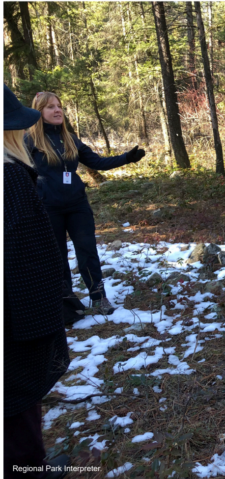
Regional Park Interpreter.