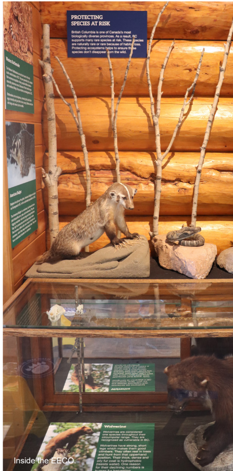
Inside the ECCO