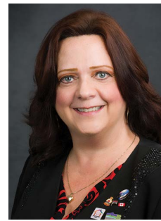
Cindy Fortin Mayor, District of Peachland