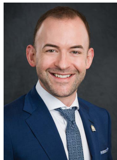
Loyal Wooldridge Councillor, City of Kelowna