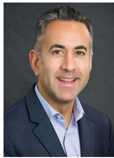
Colin Basran Mayor, City of Kelowna