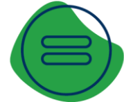
Diversity & Accessibility