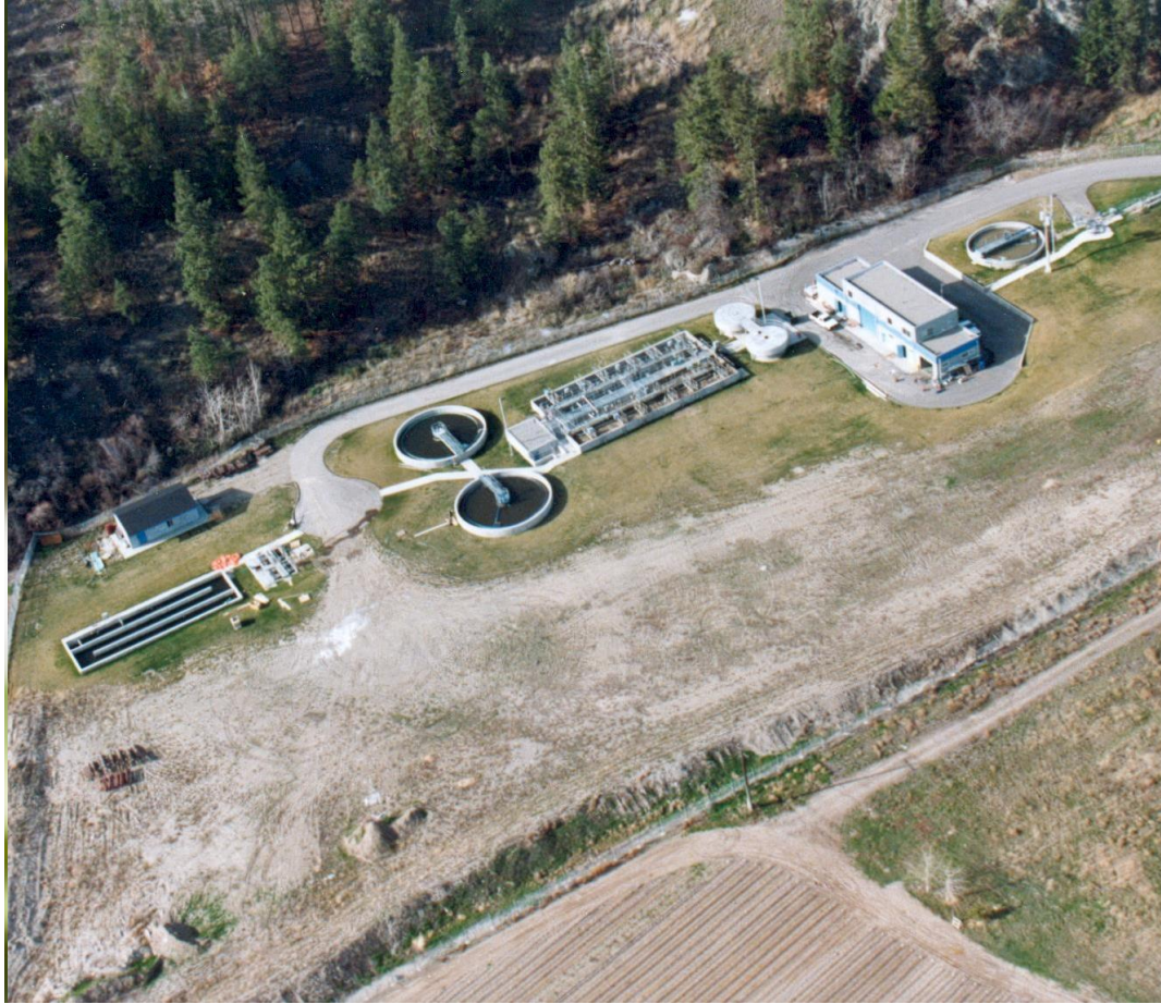
WRWWTP - 1989